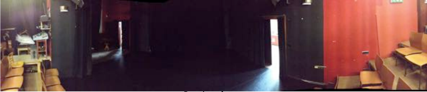
Pan view of stage