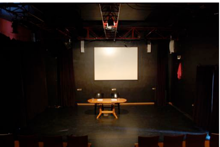
Showing fixed screen