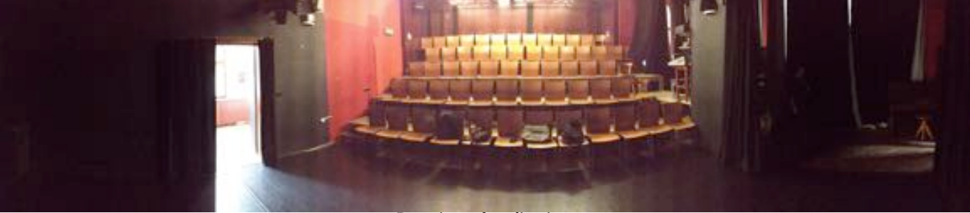
Pan view of auditorium