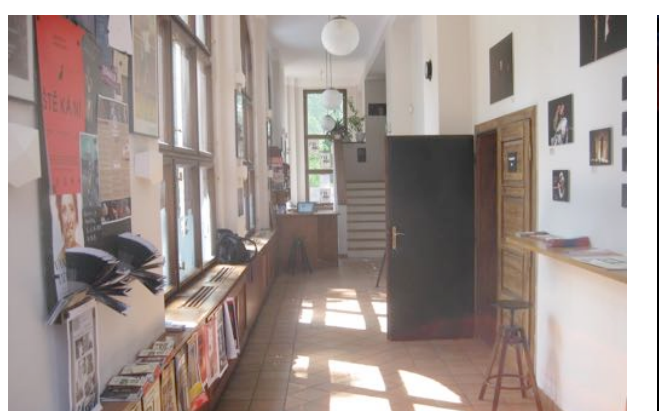
Foyer-theatre entrance on R