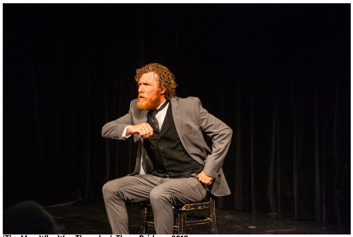
'The Man Who Was Thursday', Three Bridges, 2019

Divadlo Kampa is a black box theatre with end on, raked seating. This theatre is on the first floor and is reasonably equipped for a fringe theatre. This venue is best suited to theatre (including physical theatre, children's theatre and puppetry).