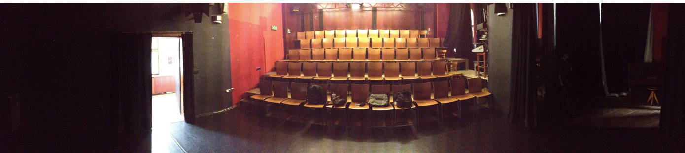
Pan view of auditorium