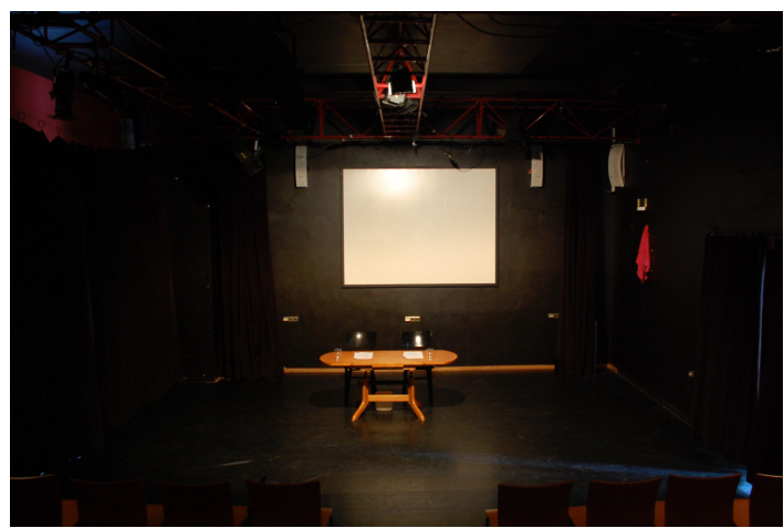
Showing fixed screen