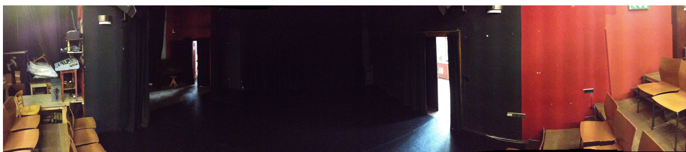
Pan view of stage