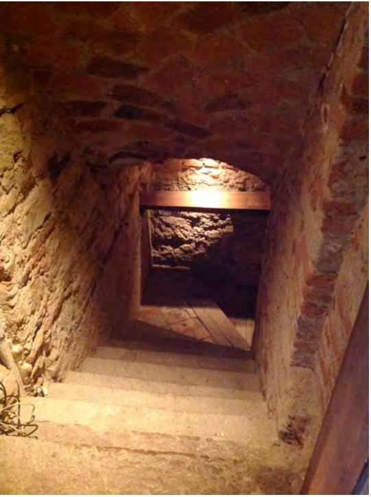
Steps down to venue

The walls are hung with paintings that cannot be removed for shows.