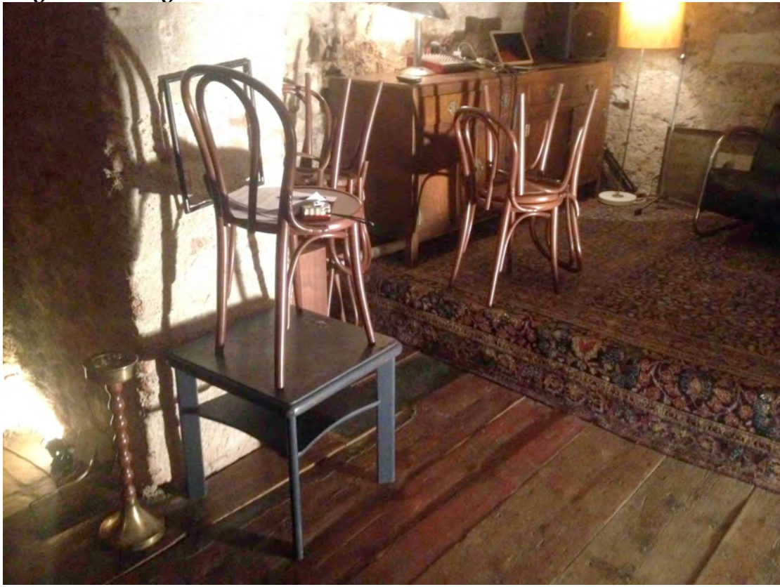
Stage SR showing sound control