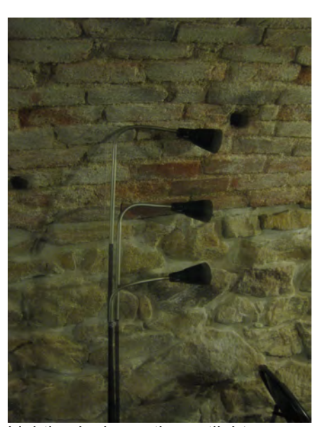
Lighting is domestic spotlights