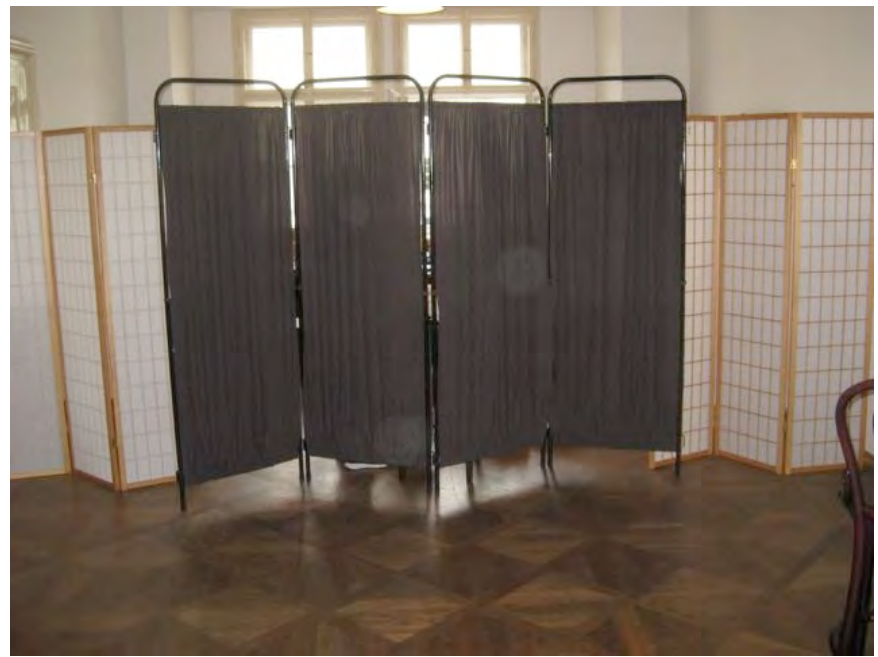
Paraban screens which screen of print storage