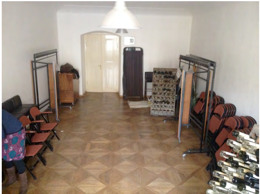
From window looking to audience entrance

Prague Fringe Festival Venue Information Pack – Malostranská beseda Multi-purpose Room